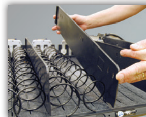
Re-configure trays to almost any package size in the field with no need for tools.