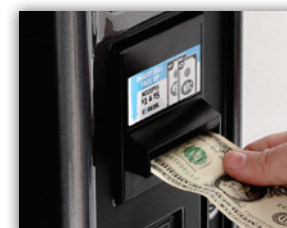
Premium Currency Acceptors

Keep your customers happy by with all their favorite chips, crackers, cookies, candy & confections.