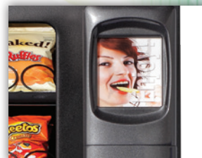
Back lighted point of sale window for advertising and specials.