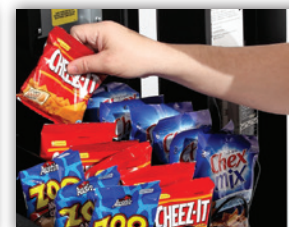
Dispenses All Brand Name Products

Keeps customers satisfied and reduces service calls for misloaded product.