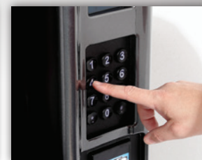
Large and easy to read selection buttons with Braille identification.