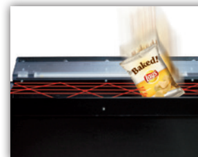
iVend® Guaranteed Delivery System

Keeps customers satisfied and reduces service calls for misloaded product.