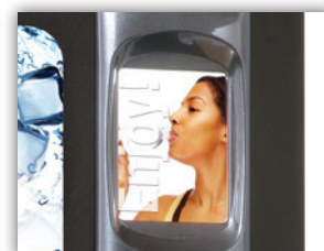
Changeable back lighted point of sale window.