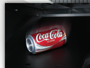
Guaranteed Delivery Sensor System

Keeps customers satisfied and reduces service calls for misloaded product.