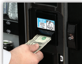
Premium Currency Acceptors Includes standard electronic coin acceptor and $1 & $5 bill acceptor.