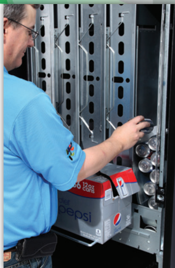
Easy Loading Product Stacks Double deep for high capacity. Built-in case support rack helps speed loading.