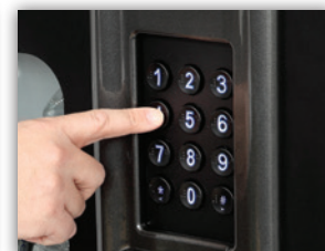
Large Braille Identified Keypad