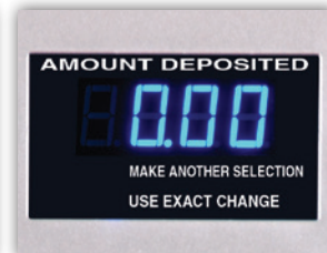
Bright LED Display With point of sale message and credit display options.